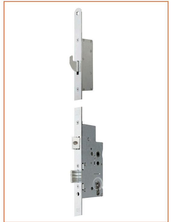
Cylinder-operated 5040 Lever-operated 5060

Nemef security cylinders, security architectural hardware, security hinges, and adjustable strike boxes complete the multi-point lock and ensure a smooth and secure closure of the door.